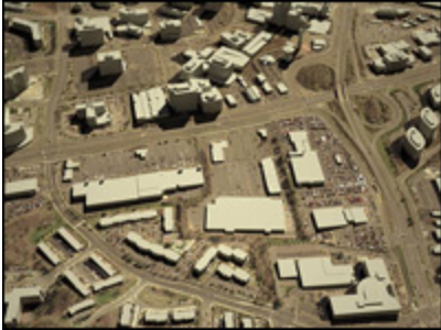
How Tysons 7 looks now.

Tysons 7, on the west end of Tysons Corner, is a small section of the sprawling suburban mall. Below is an image of how the area currently looks — and what the urban planners have visualized for redevelopment.