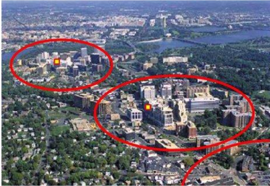
Arlington County, Virginia, with metro stations and development zones marked.

Indeed, Leinberger points to one section of the Washington Metro that can serve as a model for transit and infrastructure development around the country—if not the world. "The orange line," he says, "is the single most important metro line in the country." Specifically, he continues, the border between Arlington and Fairfax counties in Virginia.